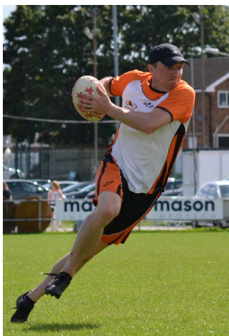
Men's 45s / Senior & Masters Nationals / N'ham