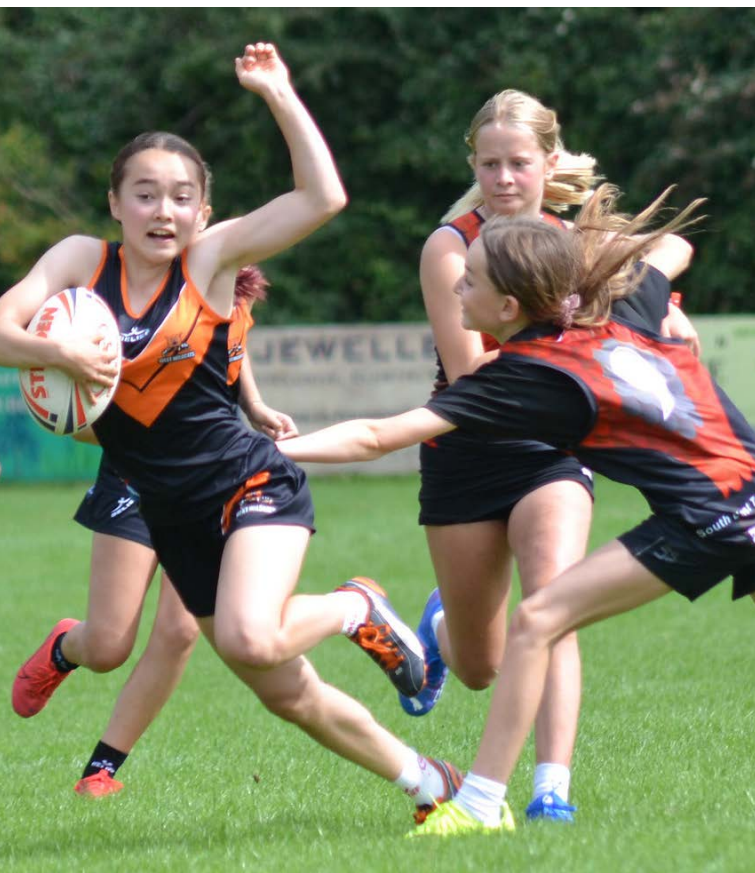
Girls 15s / Junior Nationals / Oxford