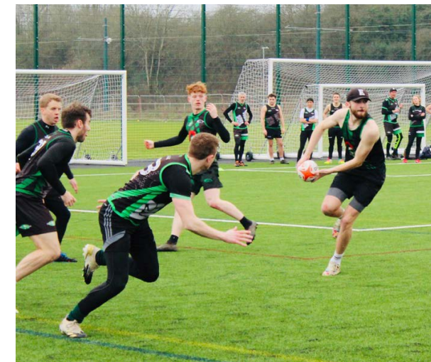
Elite Winter Series / R1 / Nottingham

We are confident of generating a surplus in 2022 as we rebuild post pandemic and will see incomes and surpluses increase during the next two-years. By year end September 2024, we expect to be generating a £16,000 surplus and reserves to be at £55,000.