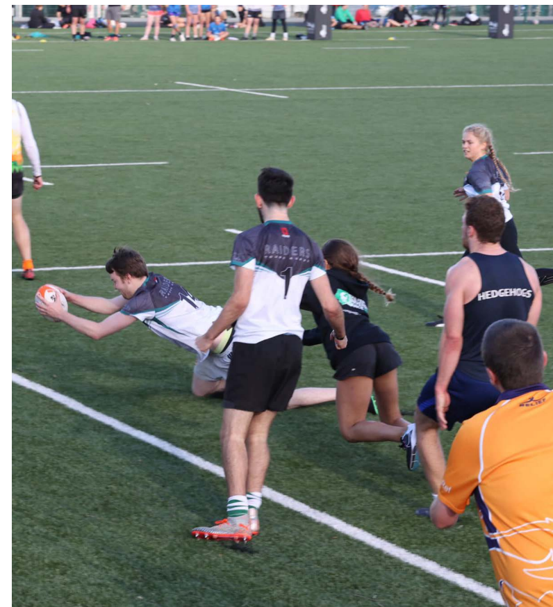
Regional growth / More regional events increasing local participation

The ETA's central team is committed to giving regional teams the frameworks they need to support the growth of the sport locally