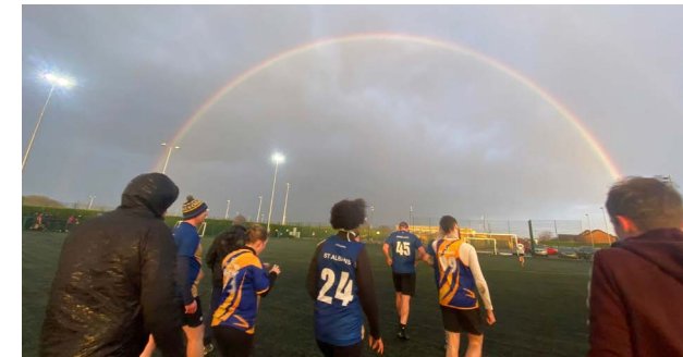
Midlands / Eastern Regional Development Series / St Ives