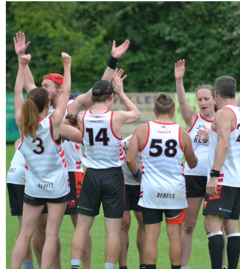
Development NTS / Oxford

““ Other purposeful partnerships are in the pipeline, with professional clubs, coaching companies and other organisations whose priorities align with the ETA's vision