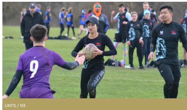
UNTS / R3