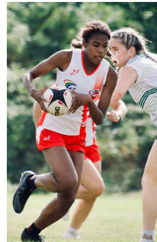
Women's Open / Autumn International Series

"I'd really like to thank Wales, Scotland and Ireland for the positive way they approached the Autumn Series and am looking forward to coming up against them in Nottingham next summer."