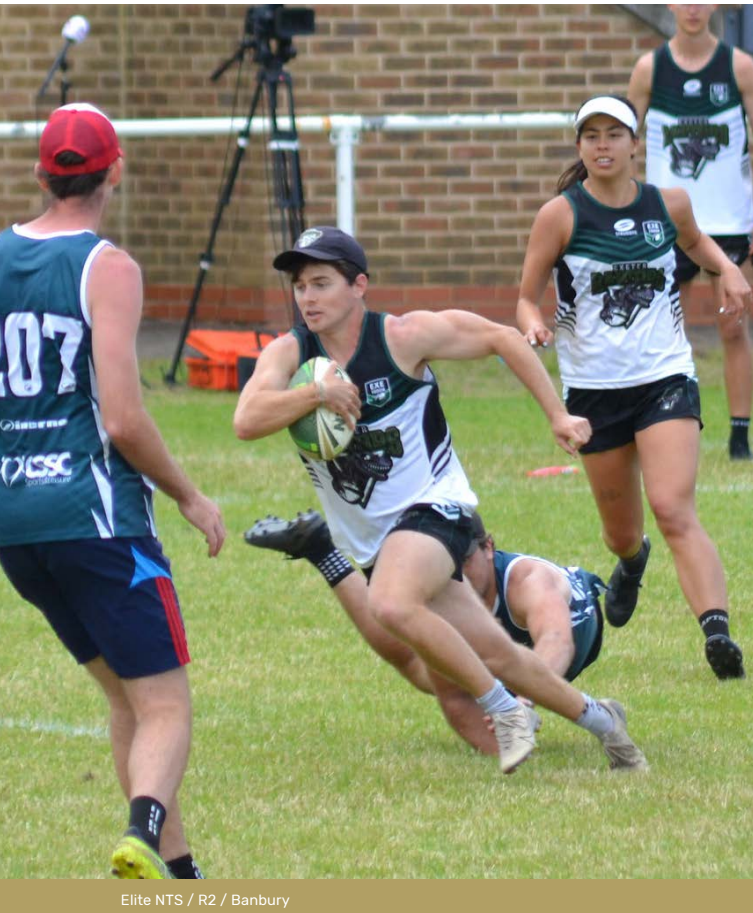
Elite NTS / R2 / Banbury