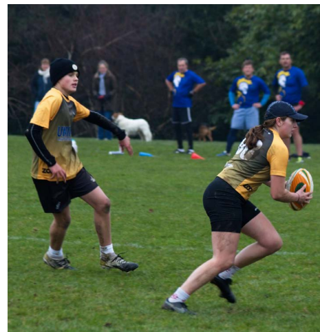
South East / Regional Club Championships