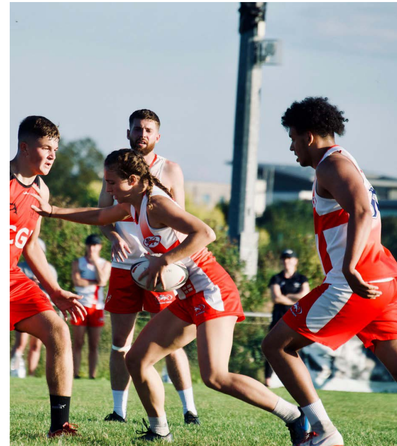
Mixed Open / Autumn International Series / Manchester