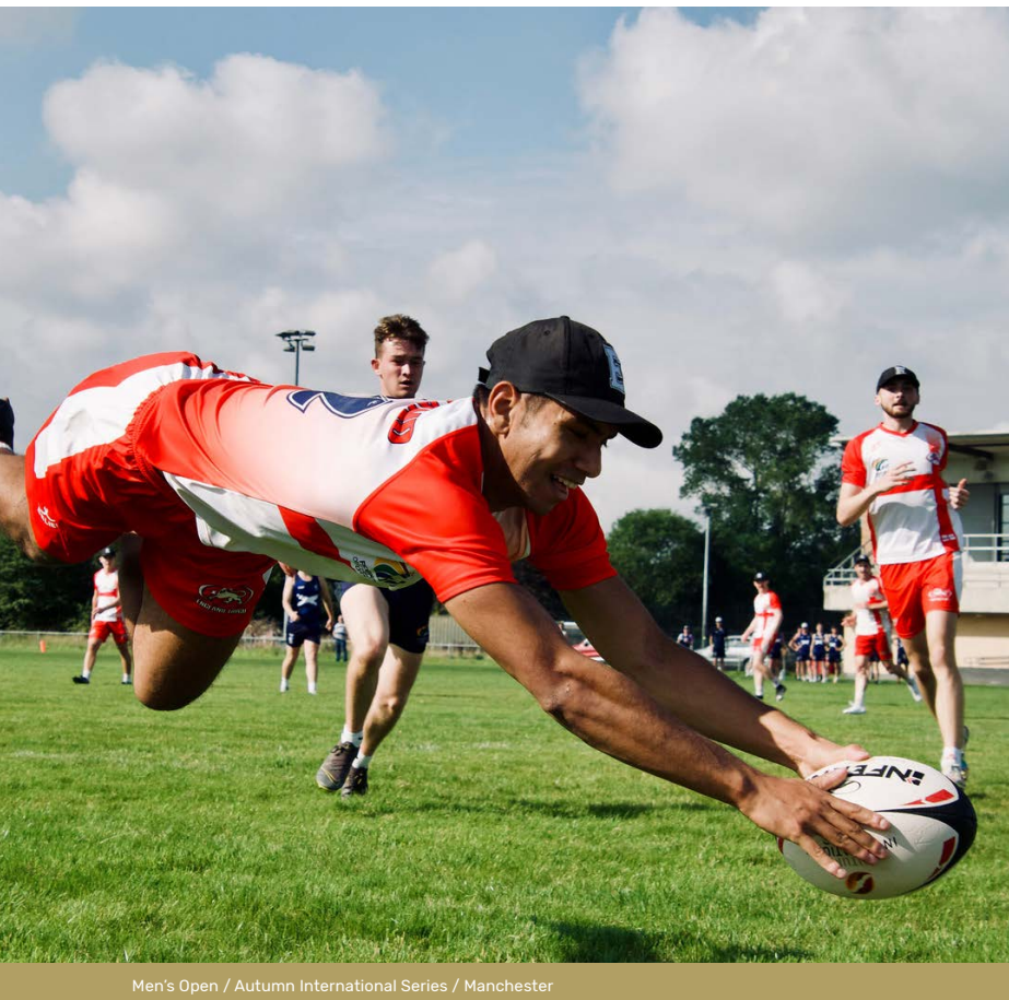
Men's Open / Autumn International Series / Manchester