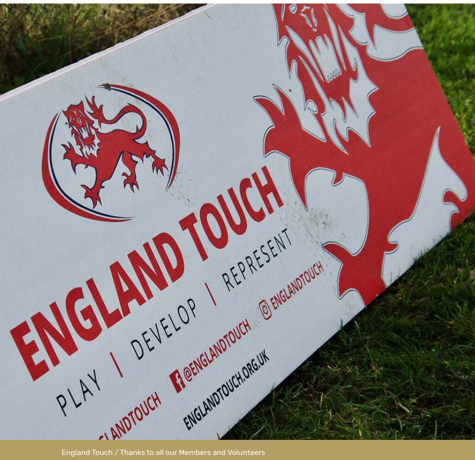
England Touch / Thanks to all our Members and Volunteers