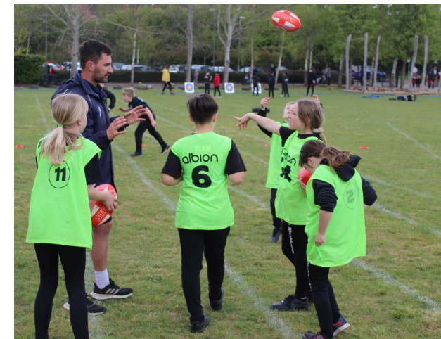
Coaching in schools / Making Touch a part of a school's sporting offering