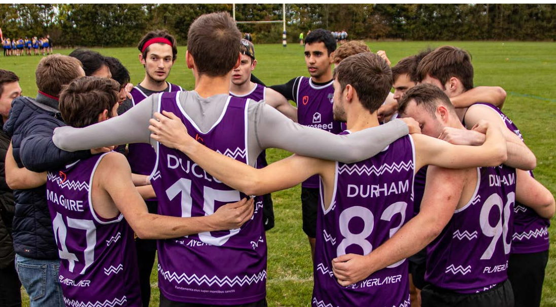
University NTS / Nottingham