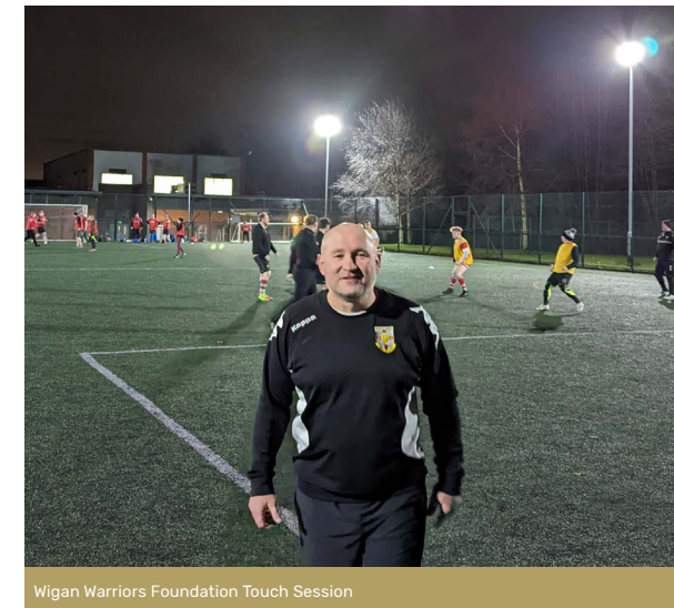
Wigan Warriors Foundation Touch Session

Our 2020s Vision has been developed by the sport and sets out the growth and development of the sport, right through to the Brisbane 2032 Olympiad. By the time we get to 2032 the sporting landscape will of course be quite different, and it is our responsibility to ensure we grow as a sport, along with our content, audience and our reach. I hope to still be serving the sport in some capacity and will always remain a friend of the sport in England.