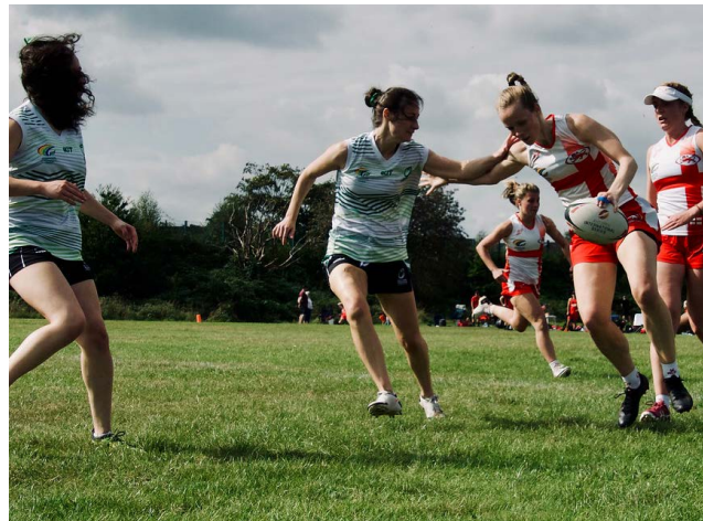
Womens Opens / Autumn International Series / Manchester