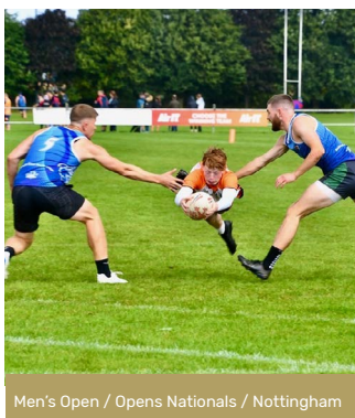
Men's Open / Opens Nationals / Nottingham